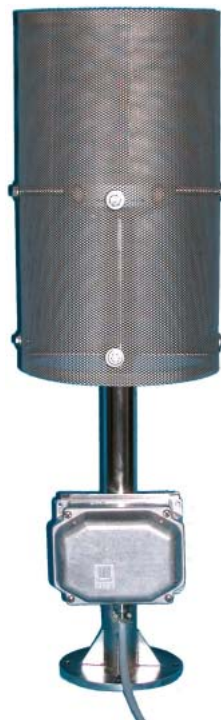
Microphone Sensor Unit